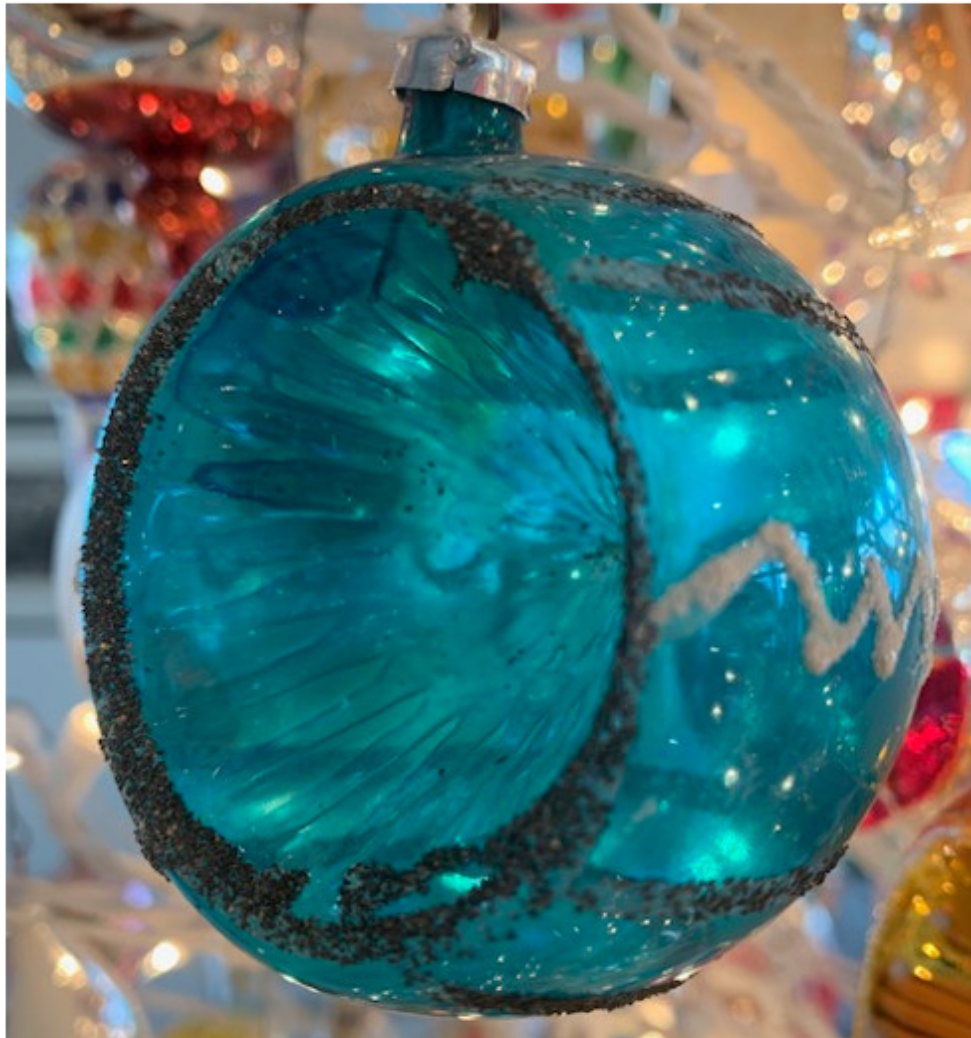
Kevin's show and tell