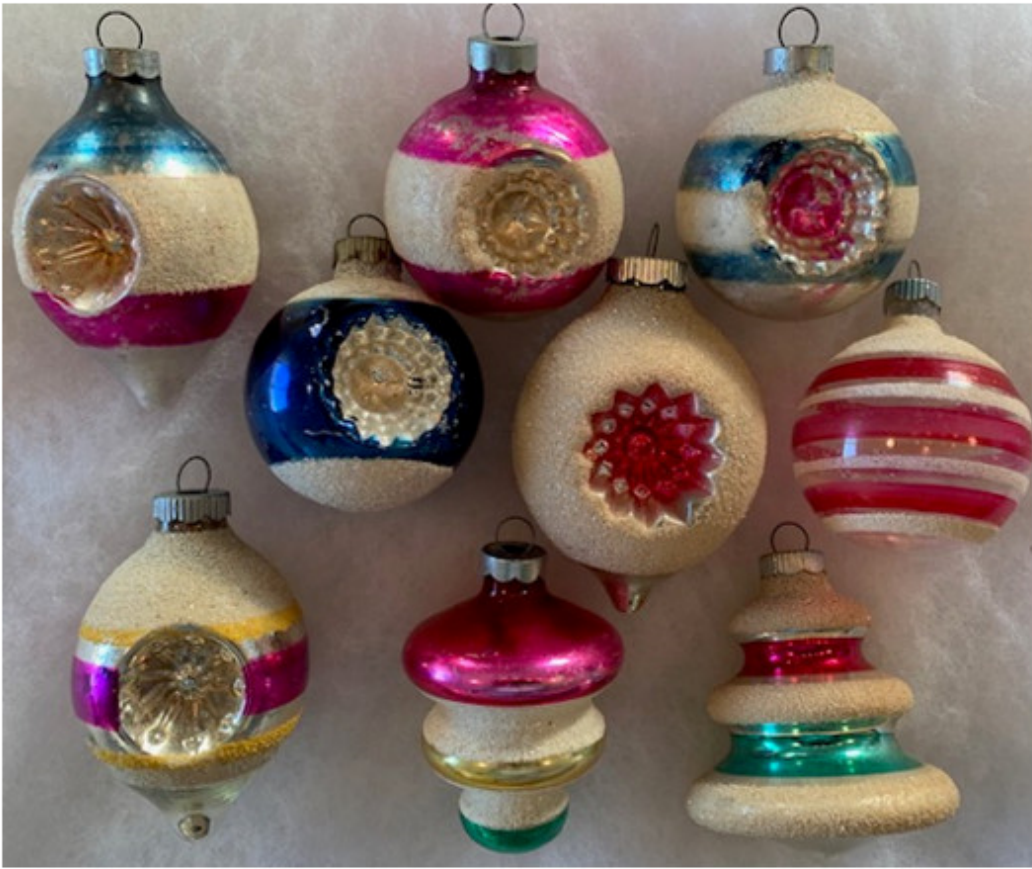
sugared Shiny Brites