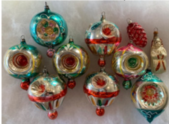
assorted European ornaments

Other European ornaments are unmarked but my guess is West Germany or Poland. They are large and include seven triple indents, and one double indent. There are also two figurals---an unmarked angel, and a red pine cone flecked with snow, from West Germany.