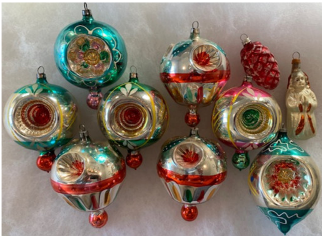
assorted European ornaments