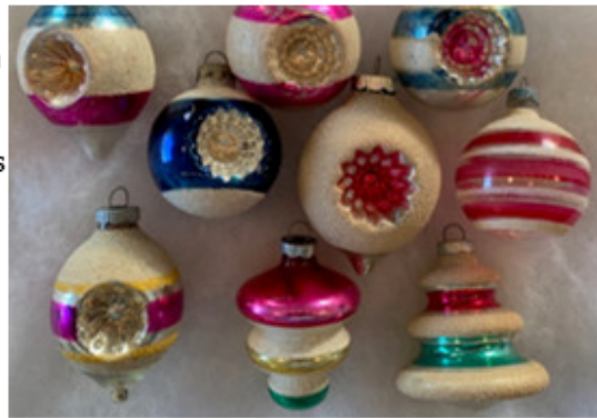
sugared Shiny Brites

This week's show and tell, from my personal collection (not for sale) is a little group of unsilvered ornaments. This style was created out of necessity, when mercury, which was used as part of a mixture on the inside of the ornaments to create a shiny exterior, was in short supply. It was rationed, and Christmas ornaments were not a priority. The resulting ornaments were clear, but many times the glass was colored. Sometimes tinsel would be placed inside the ornament for added sparkle.