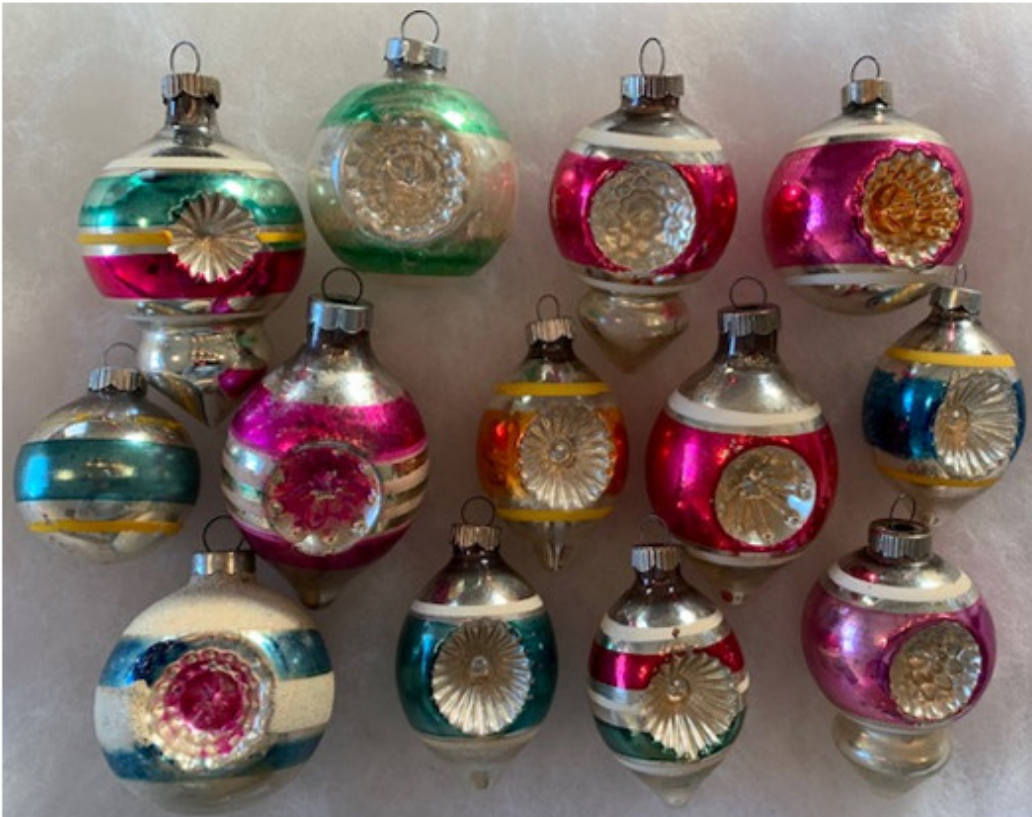
assorted Shiny Brites