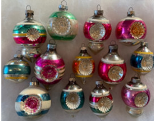
assorted Shiny Brites

There were shortages in Europe too, so ornaments from there were also unsilvered. This large German pinecone is multicolored and has aged very well.