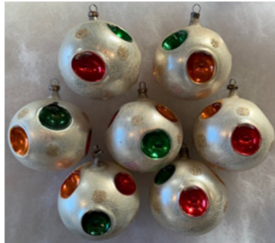
polka dots from East Germany

As of this writing we have an assortment of old ornaments that have not yet been put out for sale in our stores. They probably look a lot like most of our trees---a miscellany of memories of Christmases past. Despite that it's the end of our collection this year, there are some treasures. One group that I find especially interesting is a group of "polka dot" ornaments. These silver globes have large dots of red, green, and orange---an unusual combination of colors. The silver part of the ornament looks like a window that's been visited by Jack Frost---full of curious patterns. Most interesting of all is that these ornaments are marked EAST Germany. I've seen ornaments marked GDR (German Democratic Republic, i.e., East Germany), but never distinctly marked "East Germany." We have a group of these beauties, and not all of the caps are marked, but I bought them all together, and they are identical.