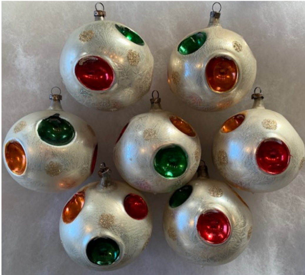
polka dots from East Germany

questions or comments. If you are interested in purchasing ornaments pictured in this blog, please contact Kelly, who handles mail order sales, at 262.693.2040 x101 or info@milaegers.com .