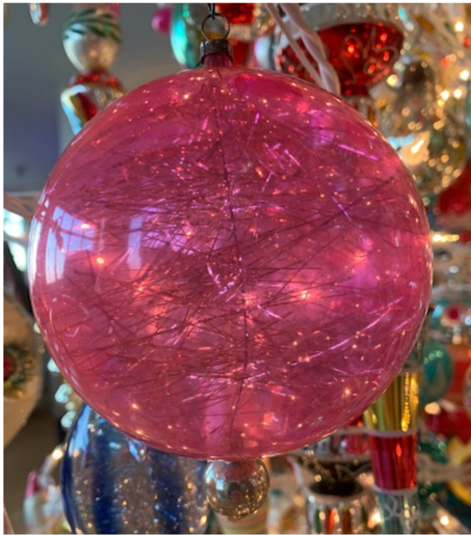
Kevin's show and tell