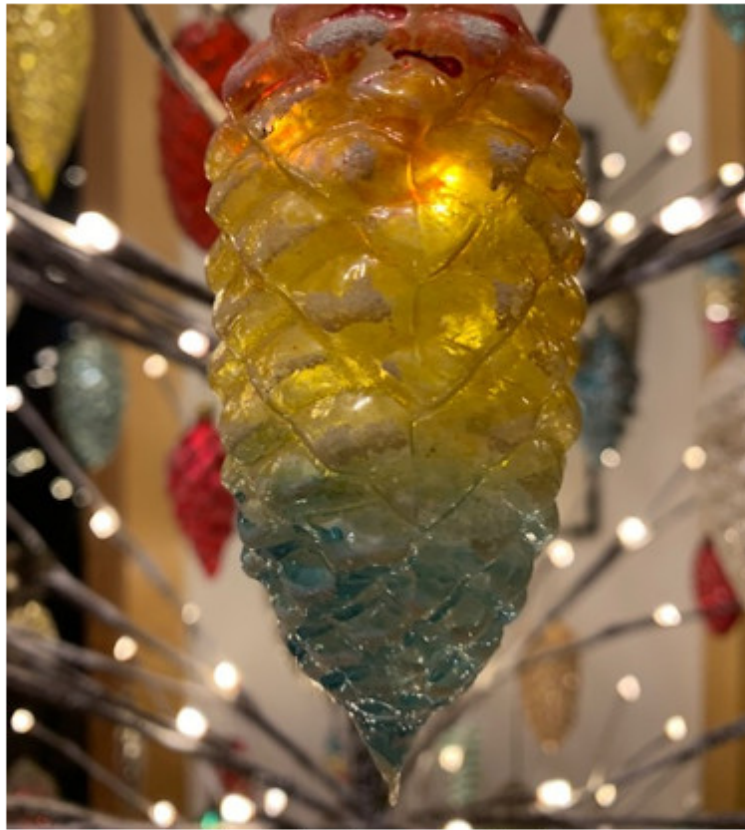
Kevin's show and tell