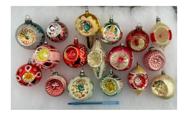
Medium Indents 1

Most indent ornaments have two indents. A few have just one, and some have three or more. I think I have one at home that has ten. Another of the indents in my personal collection has an indent that is so deep that it nearly touches the other side of the ornament. Usually the indent is silver, for greatest reflection. But many indents are painted, sometimes with several colors, all meant to accentuate the depth of the indentation. As with other ornaments, the variations are endless. That's a good thing for serious collectors. So much to search for and choose from.