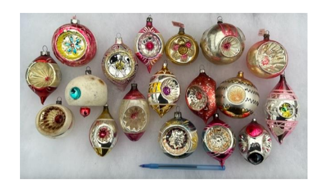
Medium Indents 2