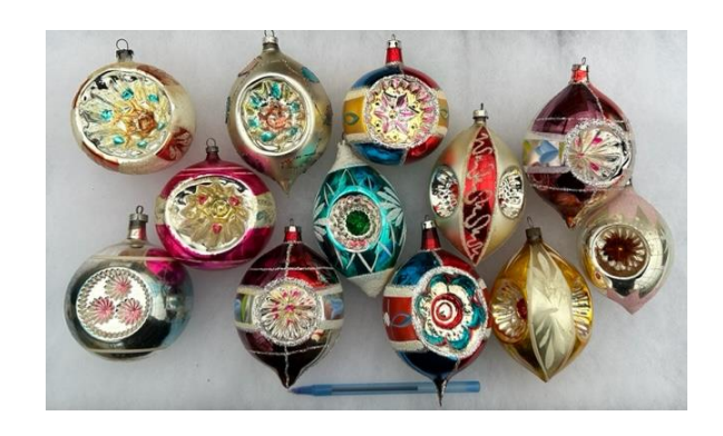
Large Indents 1